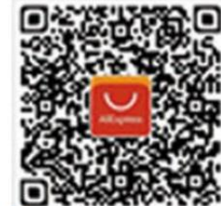
Aliexpress Store URL